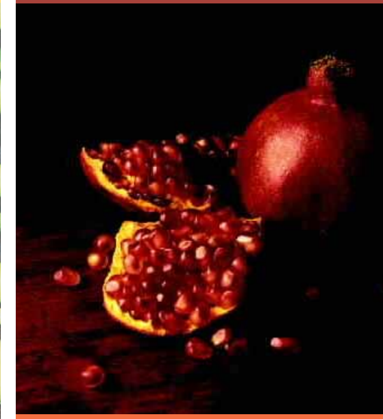
DULUX ORANGE KEEPER