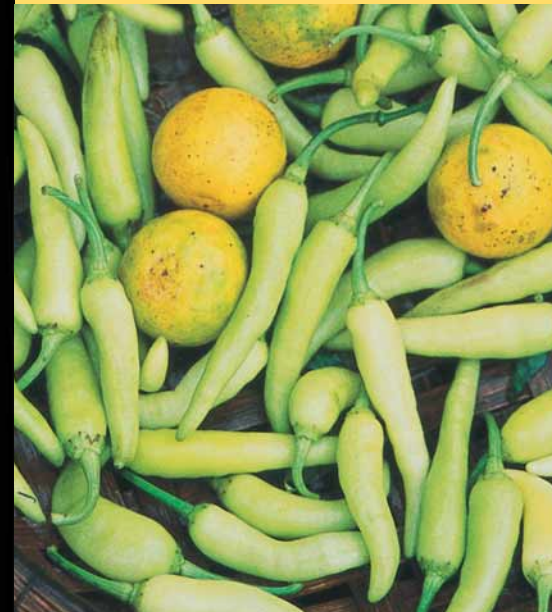
DULUX FIJI PALM